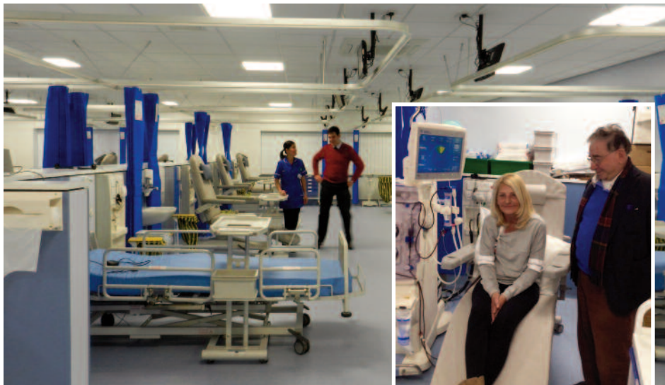
Open Day – December 2015