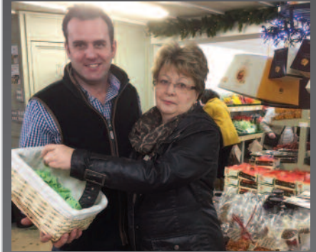
Giant Panettone raffle

Sales of AKPA Christmas cards were again very successful, raising a total of £2,359. Thank you to everyone who brought and sold our cards.