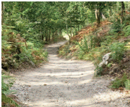
The Camino – ancient pilgrim path to Santiago